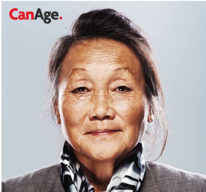
VOICES of Canada's Seniors: A Roadmap to an Age-Inclusive Canada